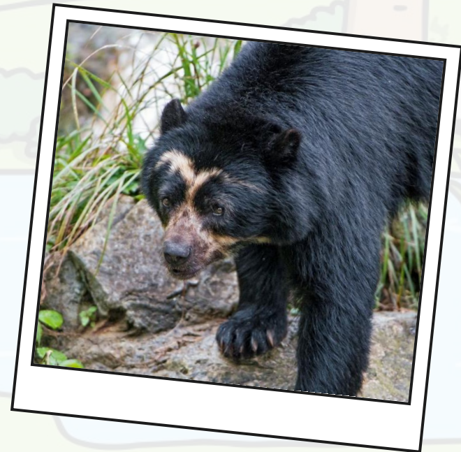
Photo courtesy of tambako (@flickr.com) - granted under creative commons licence – attribution